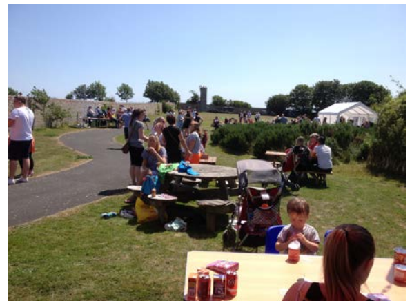
Fabulous Fun Day, July 2015

The events that Friends usually puts on each year for the children and young people are the annual Fabulous Fun Day, the Christmas Disco, and the Prom for Link College students. These are not intended to make money but to be lovely events for them to attend. This year was no exception, they were wonderful. For the second year running both the Christmas disco and the prom covered their own costs, which is amazing. For the Fabulous Fun Day, we bought two gas barbecues which will last us for years: these are also available to hire for parents and staff, at very reasonable rates!